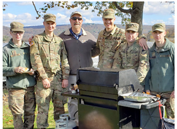
A group of cadets from the military academy prepared hot dogs and hamburgers for everyone after the Challenge.